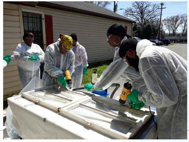
Region 4, TWIN-Training to Work an Industry Niche Brownfields Job Training Program

EPA Region 4 Brownfields, College and Underserved Community Partnership Program (CUPP) & EJ Programs