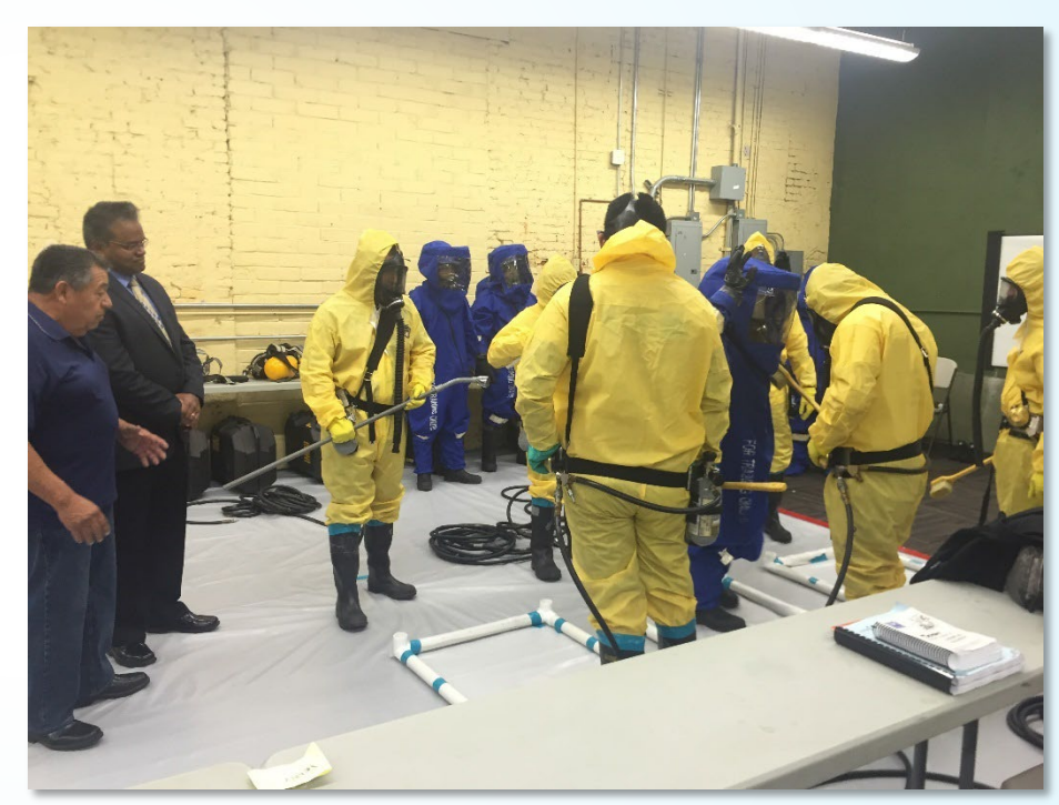
Region 9, Los Angeles Conservation Corps HAZWOPER Training