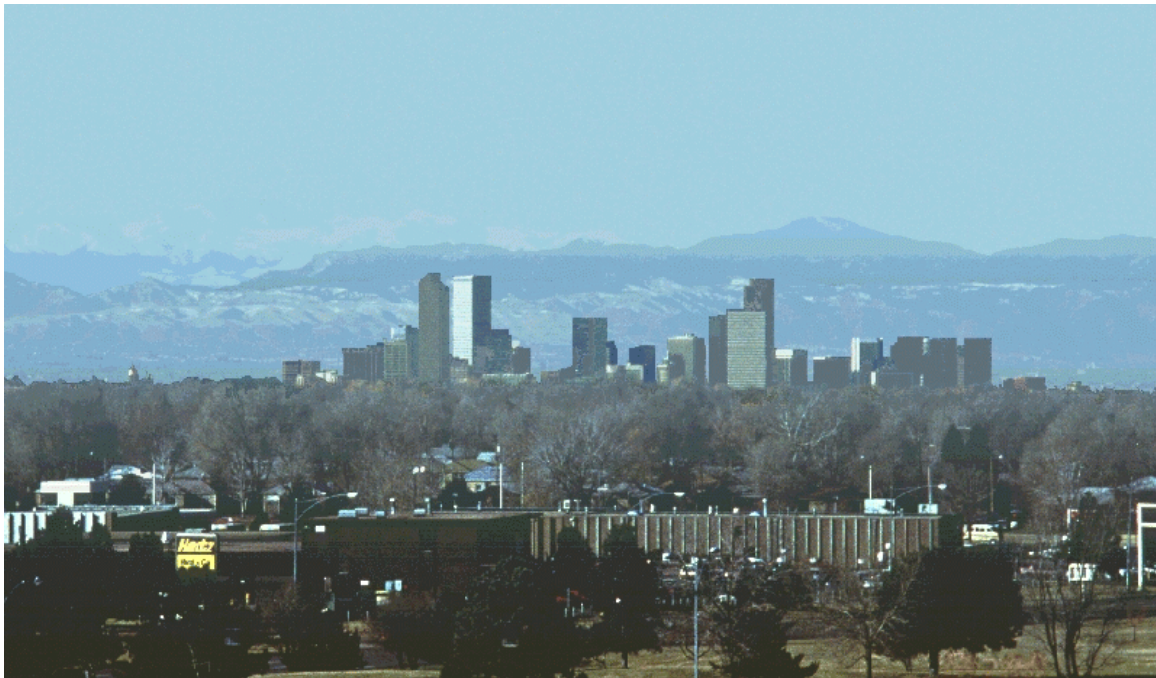
Figure 5-8. Denver, CO - 61 \text{ Mm}^{-1} (64 km visual range)