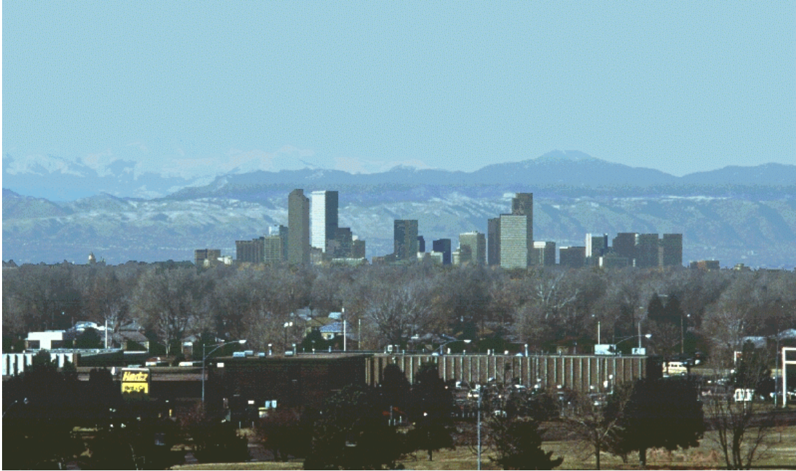
Figure 5-7. Denver, CO - 51 \text{ Mm}^{-1} (77 km visual range)