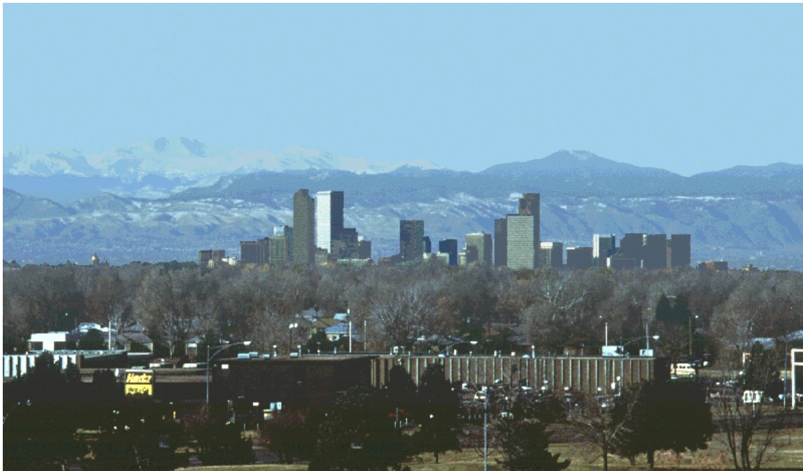
Figure 5-6. Denver, CO - 43 \text{ Mm}^{-1} (91 km visual range)