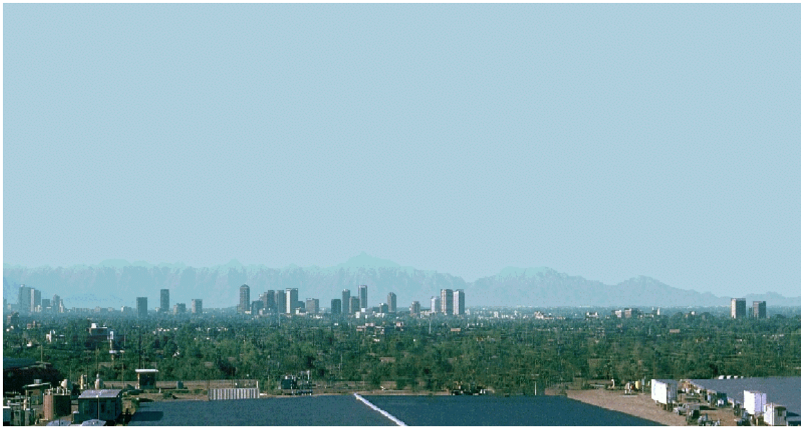
Figure 5-16. Phoenix, AZ - 15 \mu\text{g}/\text{m}^3 \text{PM}_{2.5} (41 km visual range)