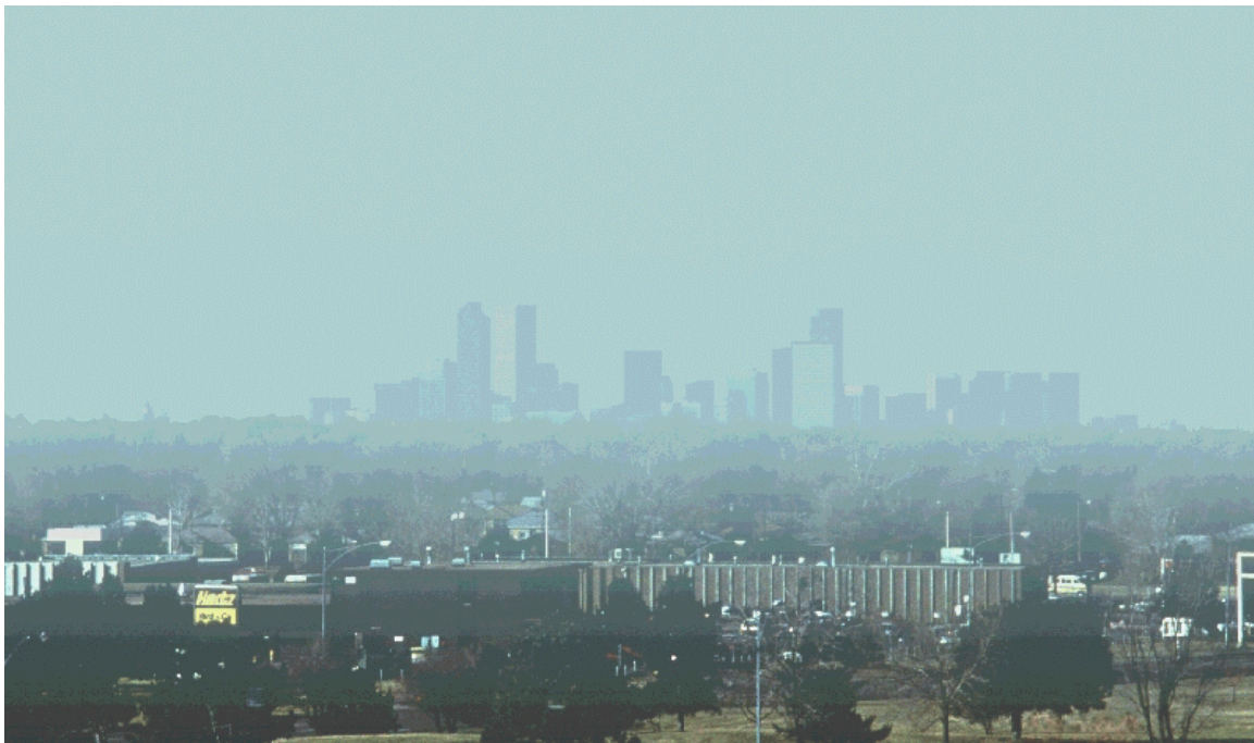
Figure 5-12. Denver, CO - 258 \text{ Mm}^{-1} (15 km visual range)