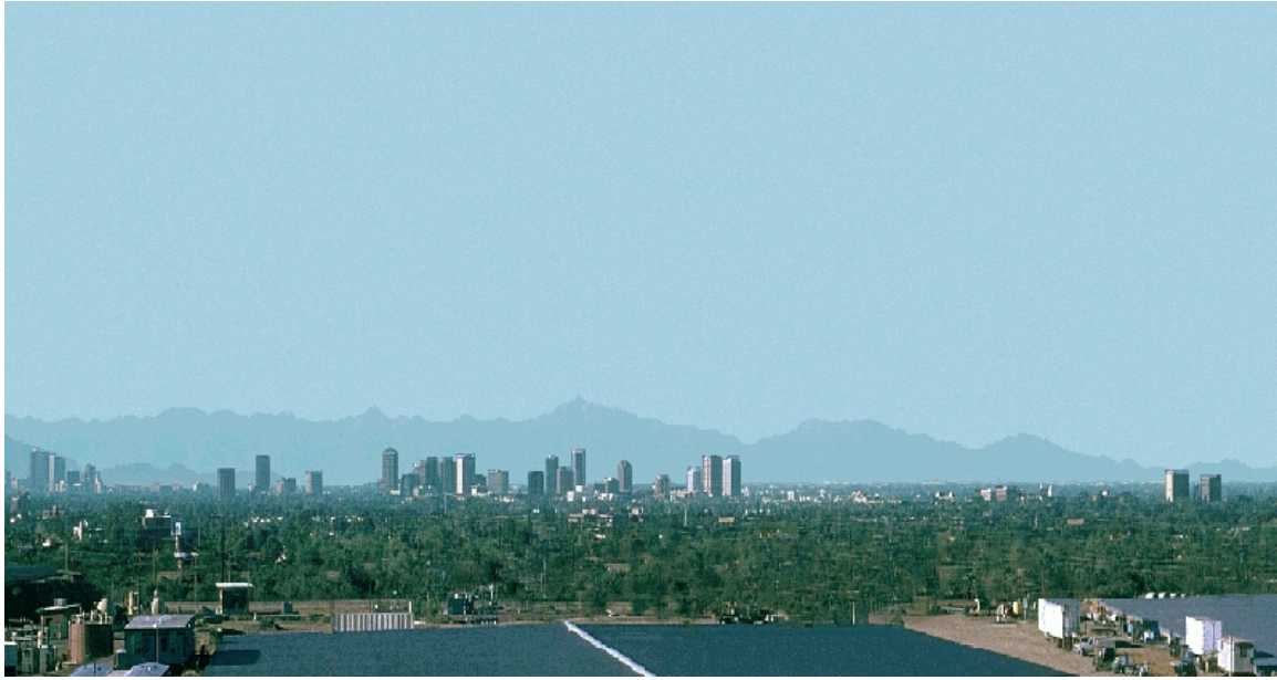
Figure 5-15. Phoenix, AZ - 10 \mu\text{g}/\text{m}^3 \text{PM}_{2.5} (52 km visual range)