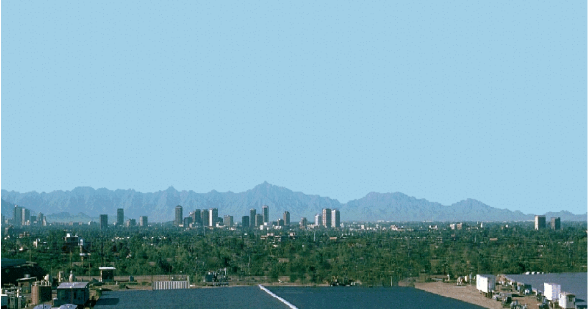
Figure 5-13. Phoenix, AZ - 2.5 \mu\text{g}/\text{m}^3 \text{PM}_{2.5} (87 km visual range)