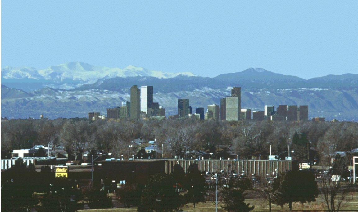
Figure 5-5. Denver, CO - 35 \text{ Mm}^{-1} (112 km visual range)