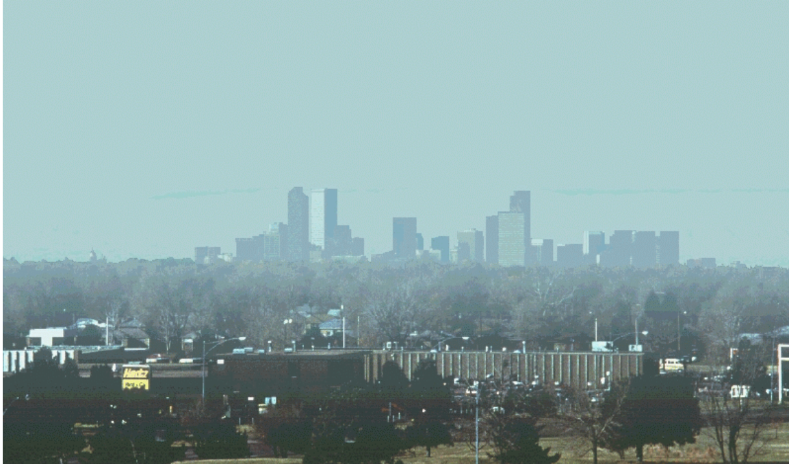
Figure 5-11. Denver, CO - 167 \text{ Mm}^{-1} (23 km visual range)