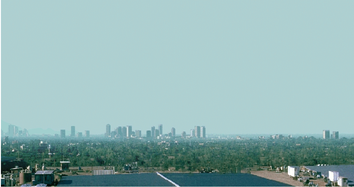
Figure 5-19. Phoenix, AZ - 40 \mu\text{g}/\text{m}^3 \text{PM}_{2.5} (20 km visual range)