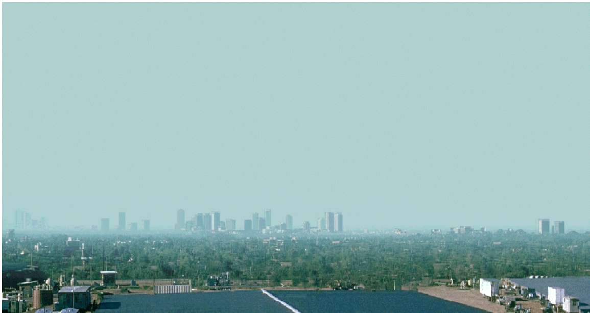
Figure 5-20. Phoenix, AZ - 65 \mu\text{g}/\text{m}^3 \text{PM}_{2.5} (13 km visual range)