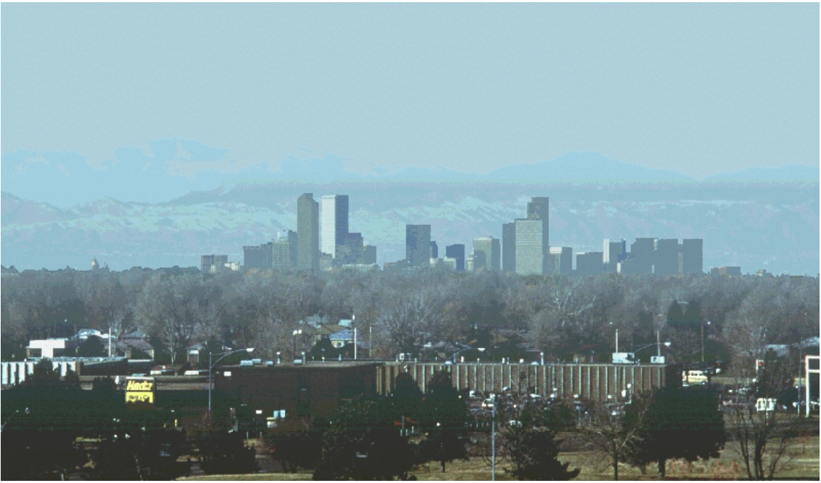
Figure 5-10. Denver, CO - 93 \text{ Mm}^{-1} (42 km visual range)