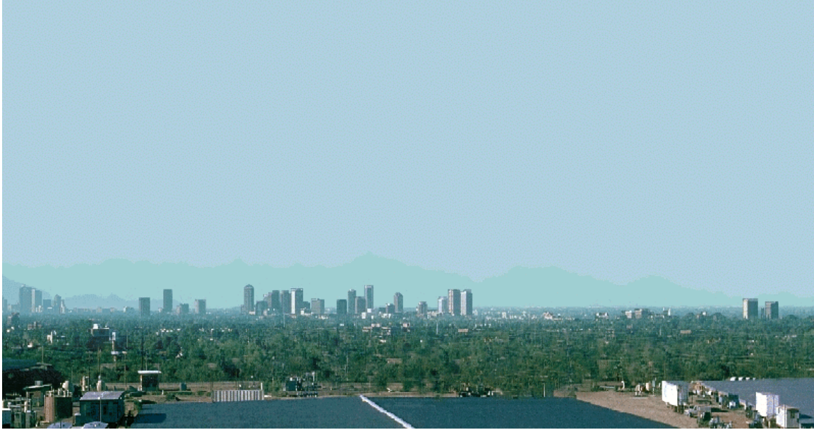
Figure 5-17. Phoenix, AZ - 20 \mu\text{g}/\text{m}^3 \text{PM}_{2.5} (34 km visual range)