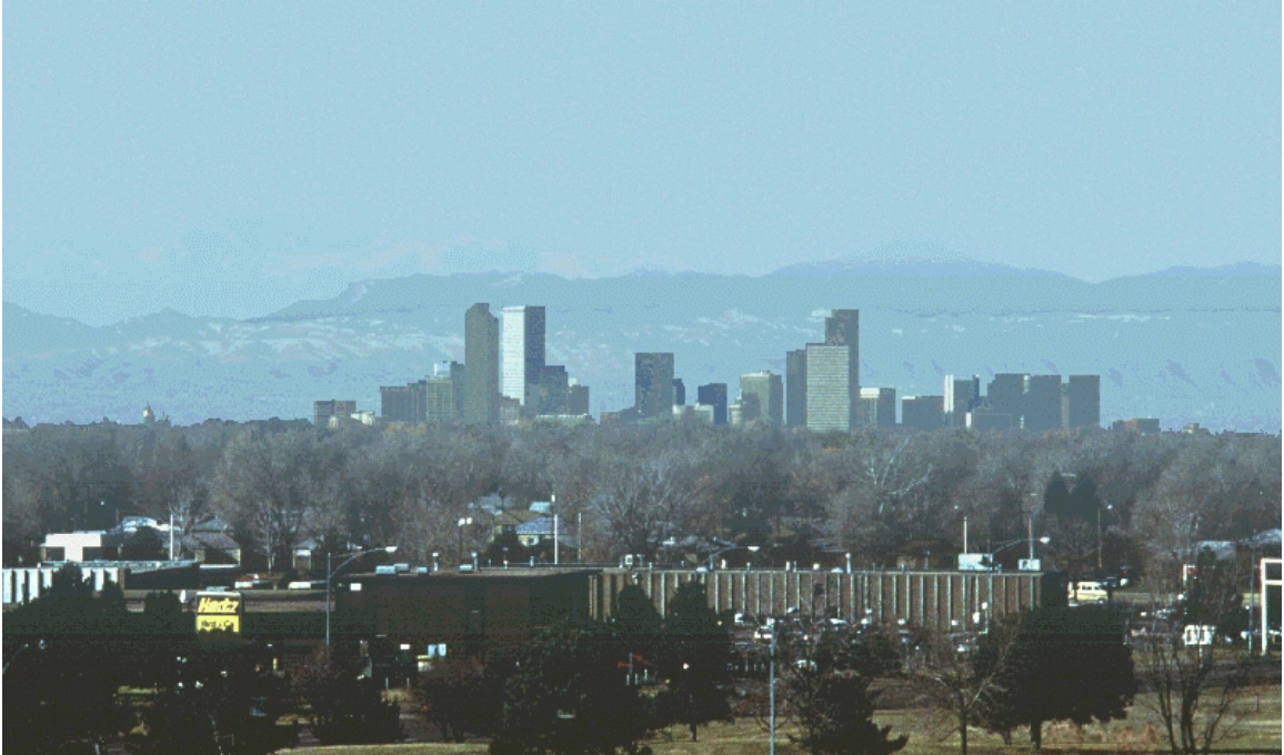
Figure 5-9. Denver, CO - 76 \text{ Mm}^{-1} (52 km visual range)