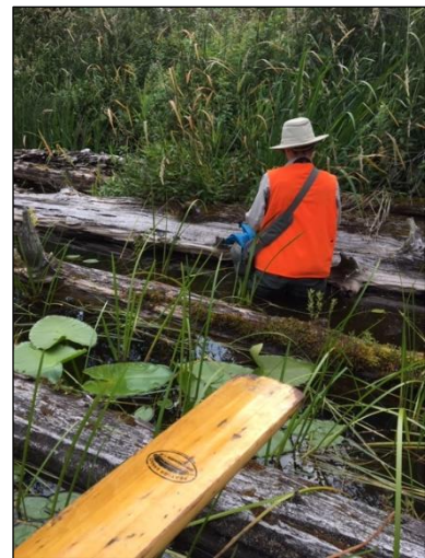
Vegetation sampling, Weallup Lake

Objective 5: Identify priority protection and restoration sites for which more detailed voluntary restoration and protection plans will be developed under the Voluntary Restoration and Protection Core Element