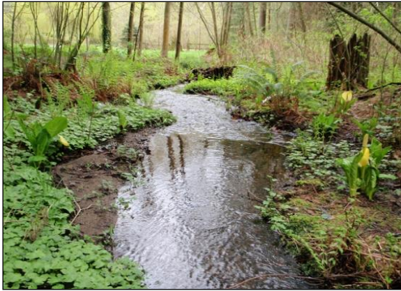
Riparian wetland, West Fork Battle Creek