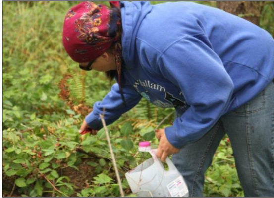
Harvesting Native Trailing Blackberry; Wetland Fringe, Tulalip Reservation

Northwest Treaty Tribes Magazine; participated in Tulalip GIS Day activities to help increase awareness and knowledge of the presence and importance of wetlands; and has hosted high school and college interns to learn about wetland functional assessment and wetland mapping efforts on the Reservation.