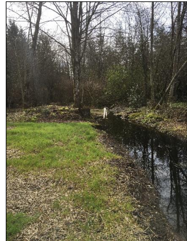
Un-permitted clearing and grading in wetland/stream buffer, Tulalip Reservation