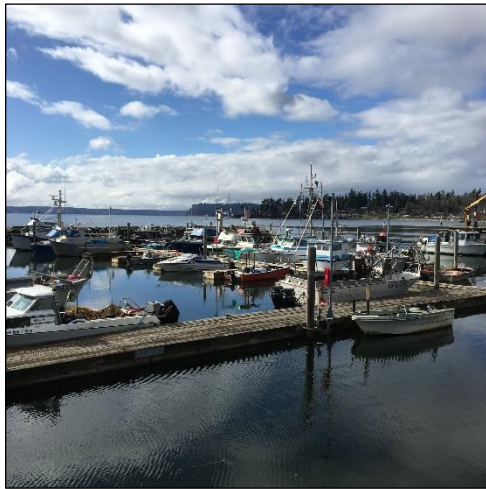
Tulalip Tribes Marina, Tulalip Bay

Goal: Develop and adopt clear and practical narrative wetland water quality standards designed to protect fish and wildlife species and tribal practices that are dependent upon Tulalip wetlands.