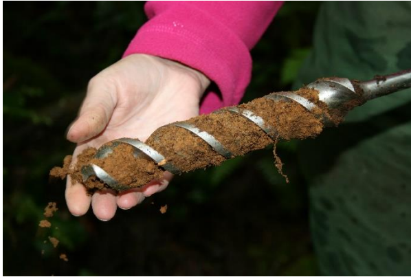
Peat soil from bog, Tulalip Reservation

provide, be protected and preserved. The Tribes conducted a cursory wetland inventory and developed guiding protective policies and regulations in the early to mid-1990's. A preliminary wetland inventory (1992-1994), a watershed plan (1996), and the first Tulalip wetland regulations were established during that time period. The 2009 Tulalip Tribes Comprehensive Land Use Plan (Tulalip Tribes 2009) identifies a