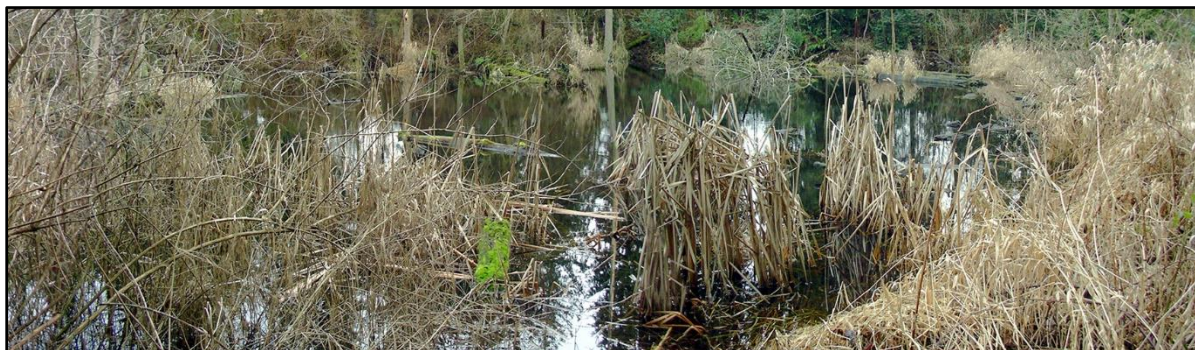
Beaver impoundment, Tulalip Reservation