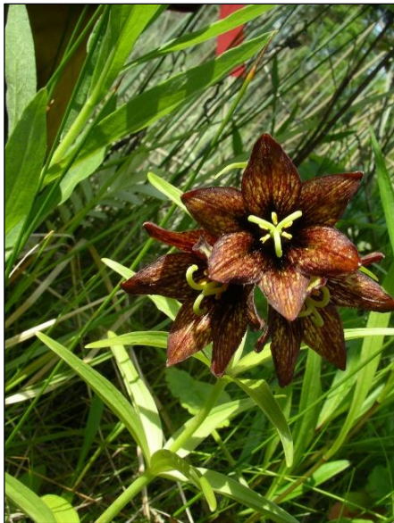
Black lily, Quilceda estuary

Additional Program work completed in 2008-2010 included development of the wetland geodatabase to document baseline conditions and to track changes to tribal wetlands; refinement of the wetland inventory; regulatory, vegetative, and landform classification of wetlands; a rapid remote assessment of wetland and adjacent upland habitat cover conditions; and identification of potential future wetland water quality monitoring stations.