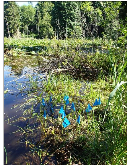
Flagging showing locations of planted Wapato ( Sagittaria latifolia ), Tulalip Reservation

Within the reservation, the Tribes manage the Coho Creek habitat enhancement project to restore salmonid rearing and spawning habitat. While some components of the project have been completed, the project is ongoing and focuses on improving the quality and quantity of rearing and spawning habitat in Coho Creek. This creek supports coho and chum salmon rearing and spawning habitat, and cutthroat trout. Other activities related to voluntary wetland restoration or enhancement projects on the reservation include reintroduction of Wapato ( Sagittaria latifolia ) into several locations (2015), work parties organized to remove invasive plant colonies or plant native vegetation, and tree planting in riparian buffers on tribal lands that were cleared prior to the establishment of buffer protections.