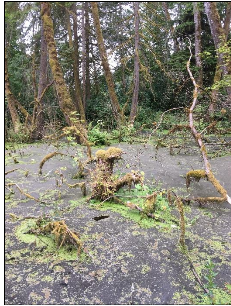
Forested swamp, Coho Creek watershed