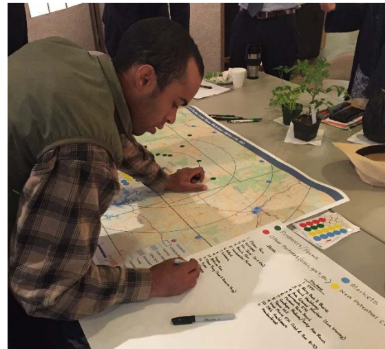
Local Foods, Local Places workshop participants in Gainesville, Missouri, mapped food system assets, using green stickers for producers and/or farms, blue for markets, red for other partners, and yellow for new potential customers.