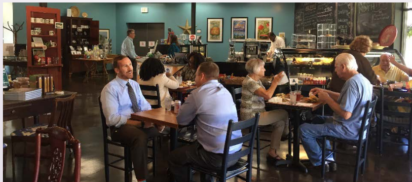
The Colleton Commercial Kitchen's retail café attracts a crowd for lunch.