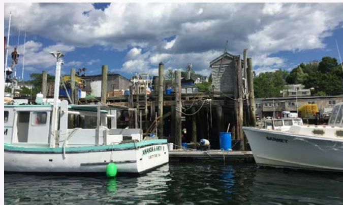
Gloucester Harbor gives the city its distinctive character and charm.

Gloucester has responded with a multi-pronged approach to cultivate local support for the city's seafood industry. Cape Ann Fresh Catch is a community-supported fishery in operation since 2008. Following the community-supported agriculture (CSA) model, members purchase shares at the start of the season that entitle them to weekly allotments of fresh seafood. Members get fresh, high-quality seafood, while fishermen have a reliable market for their product. Including recipes helps customers learn how to prepare lesser-known species that might otherwise be discarded, as conventional grocery outlets sell just a small number of the species that are caught.