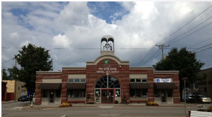
The Wild Ramp’s building anchors the Old Central City commercial corridor.