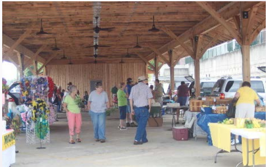
The Yadkin Valley Marketplace attracts residents and visitors downtown.

Downtown improvements included upgrades to the pedestrian alleys that connect Main Street to public parking lots and the marketplace; curb extensions to make crosswalks safer; and streetscape improvements, including flower pots, benches, planters, trees, decorative streetlights, and signage directing people to key destinations in the historic downtown.