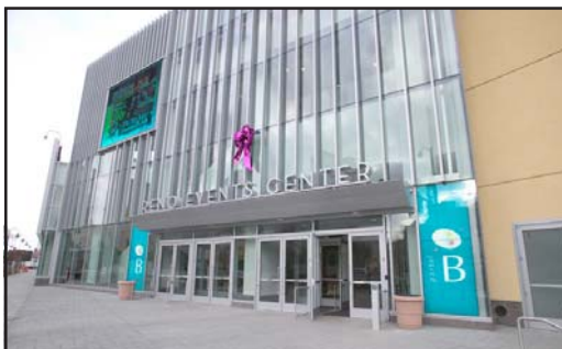
The completed Reno Events Center.

The Reno Redevelopment Agency had designated an entire city block, in the heart of downtown and within walking distance to the city's biggest casinos, as the most desirable location for construction of a large, new Events Center—a project deemed critical to the ongoing revitalization of Reno. Neighborhoods surrounding this underused city block had poverty rates of 20 percent, with income levels nearly 40 percent lower than the citywide average. Standing in the way of redevelopment, however, were certain parcels of this city block that were known to have been host to gas stations and auto repair facilities; one gas station on the property had operated for more than 70 years. The Reno Redevelopment Agency applied for and received approximately $150,000 in assessment funding from the Nevada Brownfields Program, to determine where the most severe areas of contamination were located. Following assessments, a $200,000 Hazardous Substances Cleanup Grant from EPA—used to remediate a 0.16-acre, contaminated parcel on the property's Southeast corner (most recently used for motel storage)—was instrumental in allowing the overall project to proceed.