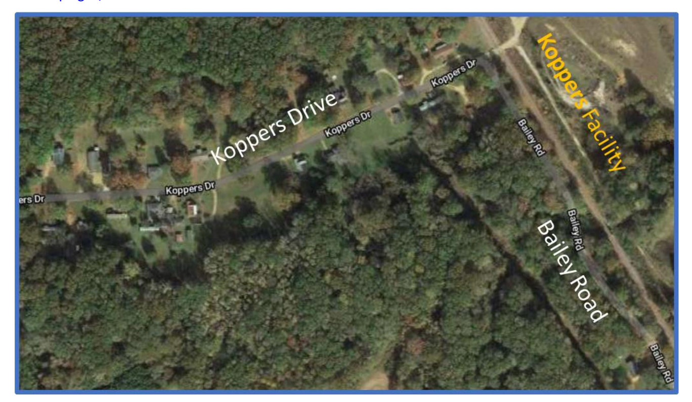
Figure 1: Samples collected along Koppers Drive and Bailey Road

This fact sheet provides more detail about the last sampling event, and the full sampling report is posted online at: www.epa.gov/ms.