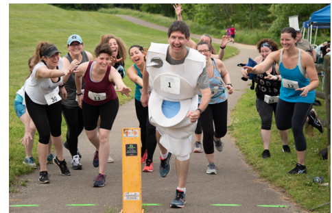
Runners chasing the “running toilet” mascot at the Fix a Leak Family 5k race.