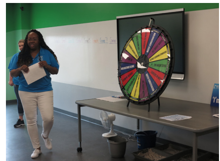
Spin the Wheel game at local middle school.

The utility's Full STEAM Ahead Robot Challenge encourages students in middle school to consider careers in the water industry; the program had 23 kids participate in 2019. The Tinker program, meanwhile, is a digital, science-based curriculum that taught water conservation to over 2,700 students. Participants received conservation kits and instructions on how to save water at home. Orange County attended “Touring the Water Facts,” held at the Orlando Science Center, which featured hands-on activities highlighting the different parts of the water production industry. The more than 200 middle school students and teachers who participated got to play the Spin the Wheel game and answer WaterSense and water conservation trivia.