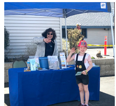
Earth Day event booth.

On Earth Day 2019, the department cohosted an event for more than 750 attendees, even providing transportation so that 300 elementary students could attend. The event featured multiple stations. Students received a passport upon entry they could get stamped and earn a prize for visiting all the exhibits. One station included a hands-on leak fixing activity with real tools. The utility distributed WaterSense educational materials and encouraged residents to sign up for free indoor and outdoor water audits. Big Bear Lake also co-hosted a self-guided Xeriscape Garden Tour with the local Sierra Club chapter. Seven water-efficient yards in the Big Bear Valley served as stops on the tour, and the utility's own demonstration garden was staffed with a native plant expert. Attendees received native plant seeds, WaterSense outdoor educational materials, and information on the utility's free rain barrel program.