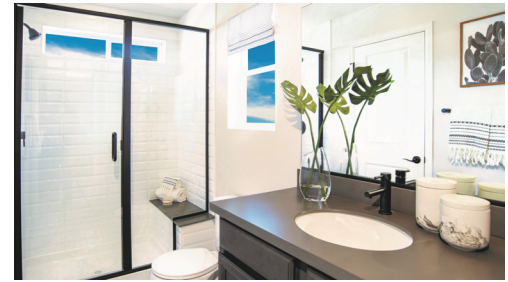
A WaterSense labeled KB Home's bathroom.

WaterSense labeled home debuted during the 2019 Consumer Electronics Show and was also featured at the 2019 International Builders' Show. Thousands of attendees were able to tour the home and learn about sustainable homes and WaterSense.