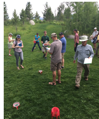
A QWEL class irrigation audit.

To recruit and promote the certified pros, Aspen conducted a variety of outreach, including email campaigns, direct phone calls, Facebook, Twitter, and newspaper advertising, as well as a quarterly QWEL newsletter that features the WaterSense affiliation. They also opened the trainings to residents who are interested in water-efficient gardening and provided a free lunch-and-learn to professionals to learn more about the Water Efficient Landscape Standards, understand QWEL certification, and receive continuing education credits..