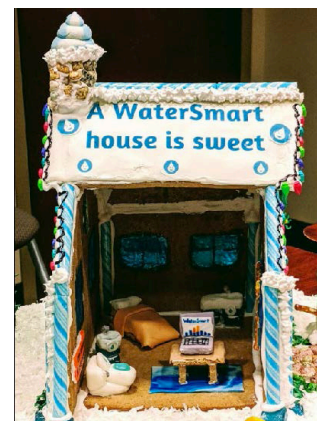
Athens-Clarke's gingerbread house contest submission.

Athens-Clarke cooked up some other great promotional ideas all year long. The utility's entry in the Athens Gingerbread Guild's Gingerbread Home Competition was a completely edible "Look for WaterSense"-themed gingerbread house. The house, viewed by 700 visitors, included a WaterSense snowman, edible WaterSense labeled products, and a logo reminding consumers to "look for" labeled products. And as part of its Level 1 Drought response strategies, the Public Utilities Department gave away 500 fortune cookies in its Water Business Office lobby with five different WaterSense-related fortunes baked inside.