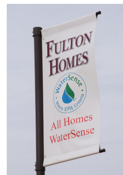
Fulton Homes WaterSense flag.

Fulton Homes conducted in-person training for all sales and design staff on WaterSense labeled homes in 2019 to ensure all employees could describe the benefits of WaterSense labeled homes. Working closely with fellow WaterSense partner Energy Inspectors Corporation, Fulton is also working on developments where all the new homes will be WaterSense labeled, ENERGY STAR certified, and Indoor AirPLUS certified.