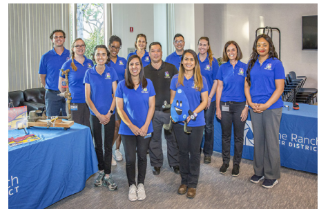
Irvine Ranch Water District team.

In 2019, IRWD's residential rebate program provided incentives for nearly 200 WaterSense labeled toilets and more than 650 WaterSense labeled irrigation controllers. To promote water efficiency in local businesses, IRWD certified six businesses through the WaterStar Business Recognition Program, which provides financial incentives for efficiency improvements and use of the WaterStar logo.