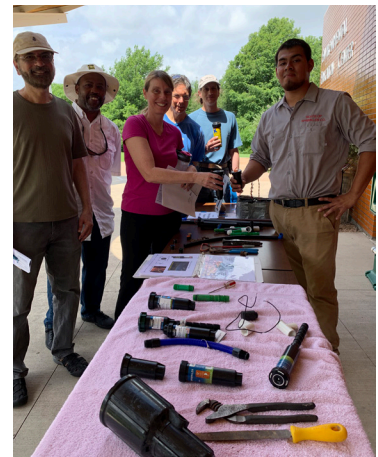
A Sprinkler Fair event station.

The City also collaborated with The Home Depot and Lowe's Home Improvement stores to provide applications for its WaterSense labeled toilet rebate program to customers; over 900 toilets were rebated in 2019, saving customers over $80,000. Additionally, the City offered free WaterSense labeled showerheads, shower timers, faucet aerators, toilet flappers, toilet leak detection dye tablets, soil moisture meters, and other items to residents year-round.