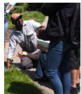
A QWEL certification workshop.

To help launch a Bay Area QWEL program, the Partnership collaborated with nine other Bay Area water utilities and the California Water Efficiency Program (CalWEP). To recruit new trainers for the program, CalWEP hosted a train-the-trainer event, and its first QWEL certification workshops certified 60 participants. QWEL was also adopted by the Southern Metro Water Supply Authority in the South Denver Metro region of Colorado, and the Metropolitan Water District of Southern California initiated a pilot program for 2020. The Partnership worked with a local community college, Santa Rosa Junior College, to make the QWEL program an integral part of its landscape irrigation class; students take the QWEL exam at the end of the semester and have to install an irrigation system with a WaterSense labeled weather-based irrigation controller.