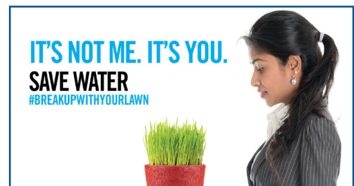
Break Up With Your Lawn promotion.

In July 2019, the utility hosted the first annual Sacramento WaterWise Garden Showcase, where more than 120 homeowners learned about WaterSense labeled irrigation controllers from Rachio, Rain Bird, and Hunter; discussed water-wise plants and trees with local nurseries and native plant associations; and explored landscape design ideas with local Association of Landscape Designers. In the fall, the City of Sacramento promoted Break Up With Your Lawn, a three-week social media campaign that used humor to suggest alternatives to residential landscapes that require heavy water usage and to "break up with their lawn." Sacramento is known for its extensive urban tree canopy, and the utility held two workshops in partnership with Sacramento Tree Foundation about smart irrigation, mulching, and maintenance of trees.